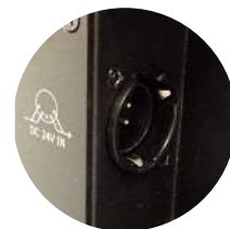
• 24 V DC power supply connector.