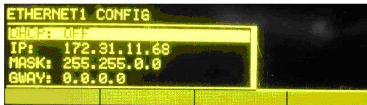
Ethernet 1 port configuration screen